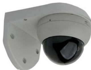
MVCHWB Wall Mount Bracket

3-D CAMERA BRACKET For maximum flexibility